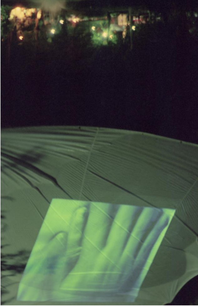
Varsha Nair and Virginia Hilyard, Your Hand Opens and Closes and Opens and Closes , 1999. Video projector and screen stretched horizontally on the pond, Installation view.