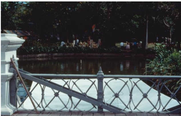
Your Hand Opens and Closes and Opens and